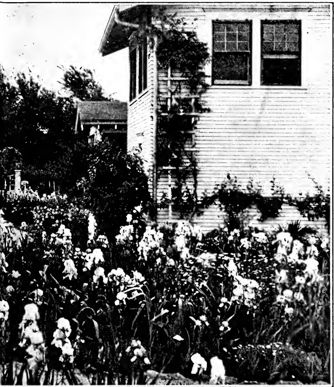
HEAVEN, THE FLOWERS THE POETRY"

LORD LAMBOURNE—EARLY. 36 in. S. Coppery fawn flushed rose; F. rich madder red. Long blooming. 3 for 25c. Each ..... 10c